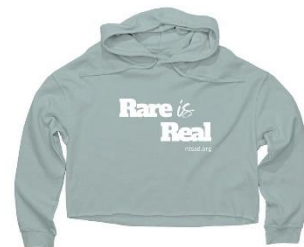
Women's Lightweight Cropped Hoodie