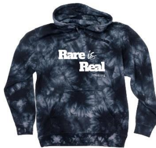
Tie Dye Pull Over Hoodie